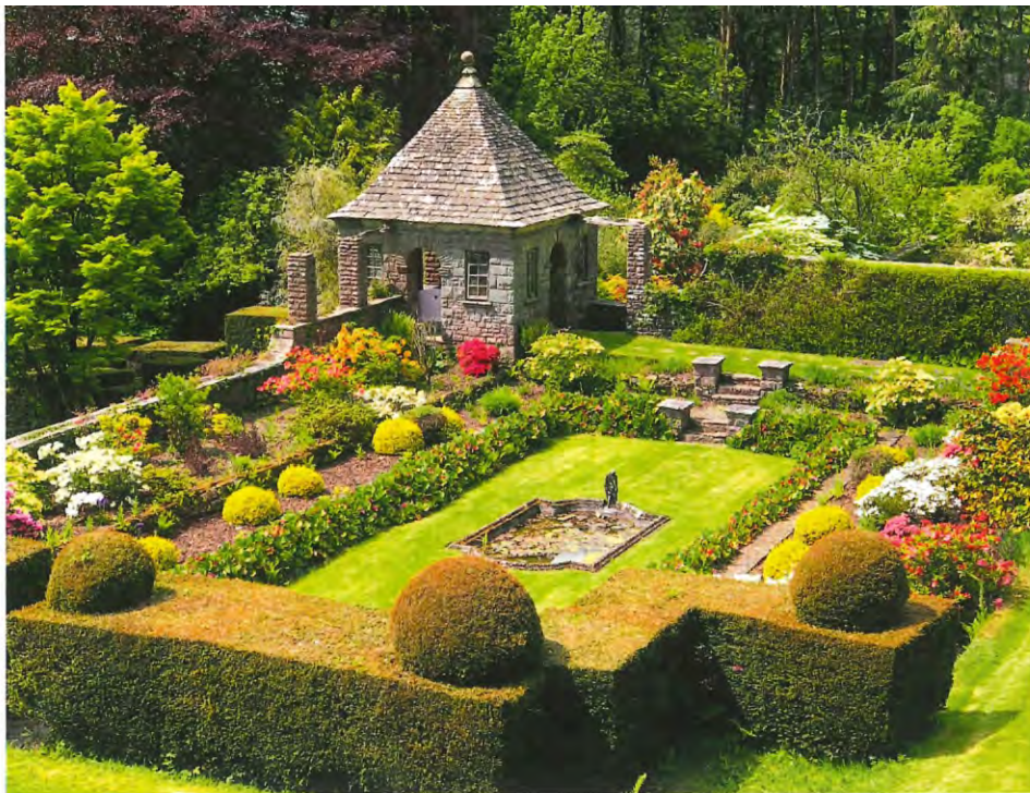
Above: The Arts-and-Crafts layout at Wyndcliffe Court, Monmouthshire, is clearly visible. Right: Rus in urbe: don't miss the annual glimpse of Spitalfields Gardens in East London