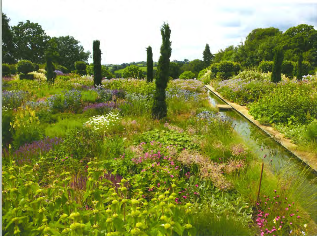
The design at Broughton Grange, Oxfordshire, was influenced by views of the landscape

In this endlessly inspiring and ever-evolving three-acre garden, set around a pretty 1912 Arts-and-Crafts house on the Herefordshire-Wales border, formality and wildness sit side by side. Owners David Wheeler and Simon Dorrell (publisher and illustrator of the quarterly journal Hortus ) have spent the past 26 years developing the gardens into a series of interlocking garden rooms and secret