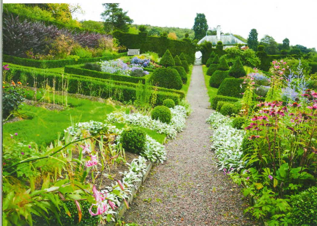
Top: Hidden away in Worcestershire, Stone House Cottage is a must-visit for plant collectors. Above: Traditional and contemporary planting at Perrycroft in the Malvern Hills

With beautifully framed glimpses from one area to the next, visitors to Perrycroft are drawn forward to discover box parterres spilling over with plants, displays of topiary, shrubs, old roses, abundant herbaceous borders, ponds and a walled garden. The planting, which is exceptional, is a mix of both traditional and contemporary styles and there are wildflower meadows and woodland, too.