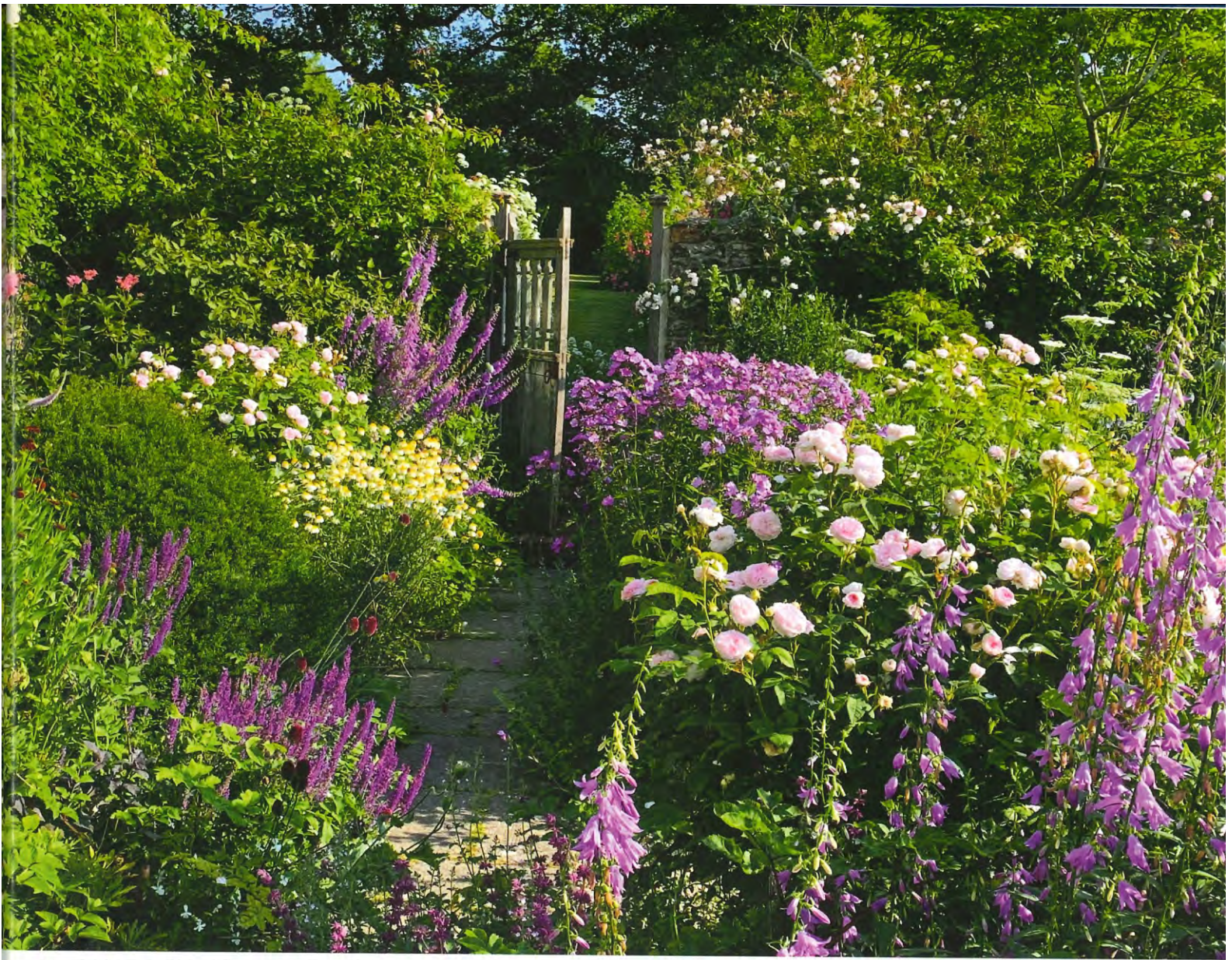
Above: New design, old setting: Arne Maynard's work complements South Wood Farm, Devon. Below: Peaceful Batcombe, Somerset

places full of style, horticultural expertise and humour (see upcoming feature, December 9).